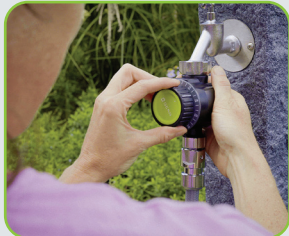
Intuitive setting and adjustment